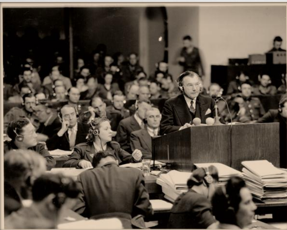
Justice Jackson at the podium