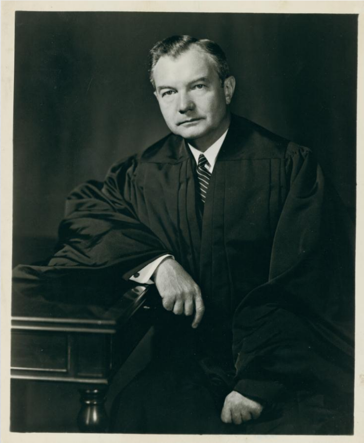
82 nd Associate Justice of the Supreme Court