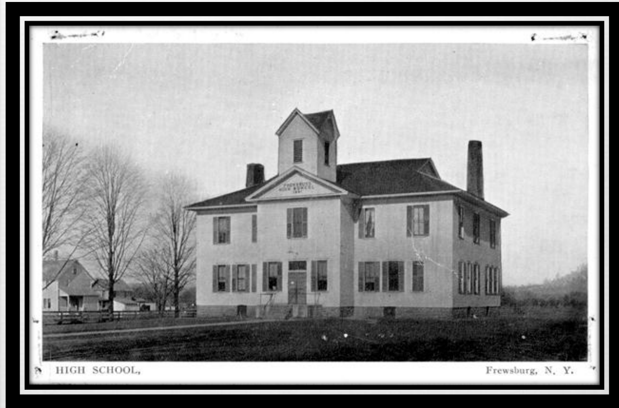
Frewsburg High School