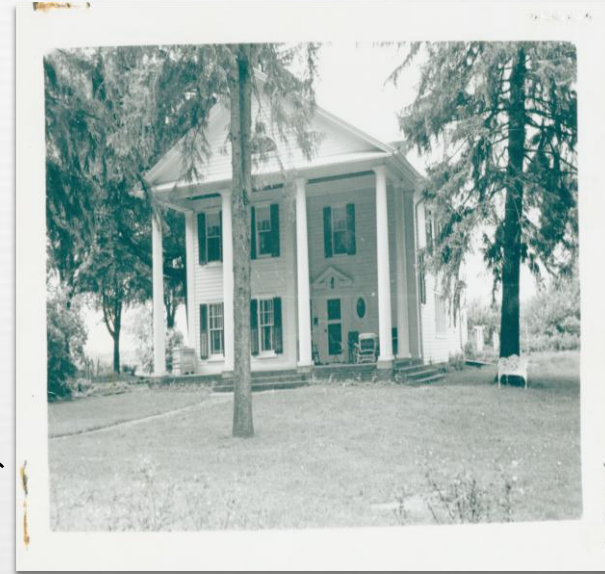
Settling in Jamestown, NY